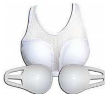
CHEST PROTECTOR FOR GIRLS