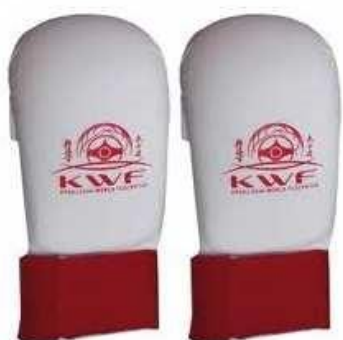
GLOVES (FROM 12 TO 13 YEARS)