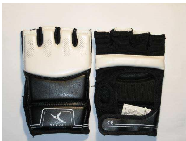
GLOVES (FROM 14 TO 17 YEARS OLD)

Another type of protections will be allowed if they offer the same level of protection.